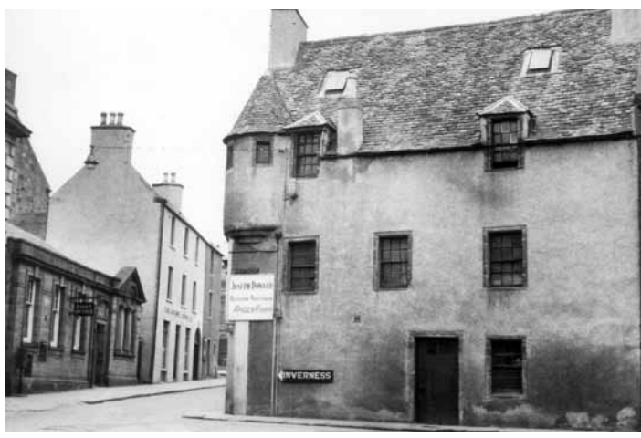
1 High Shore, Banff.

"... fifty years ago, in 1965, the Banff Preservation Society was founded. We hope to mark the anniversary appropriately."