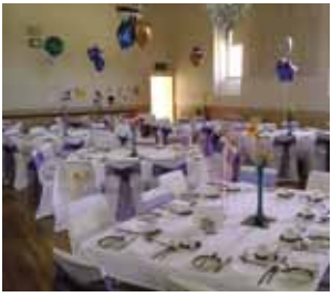
Hall decked out for wedding

"... we are grateful for all the support given, by both those who have made donations and grants toward the Association's efforts..."